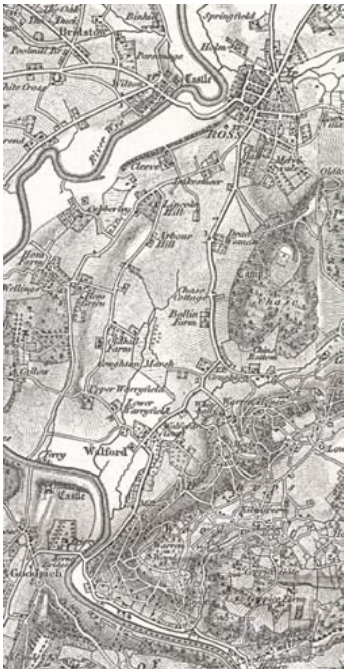
▲ Timeline Historical Map 1828 - 1831