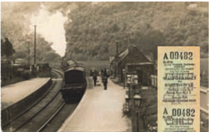
▲ Kerne Bridge Railway Station

Cross the road and walk up the lane opposite the bus shelter. Within 15 yards, go left on a track between houses. At the top of the drive, go up steps, and climb up to a track. Go right, cross another drive and then keep ahead climbing on a path between hedges. On reaching a road go left. Pass between two houses and go left at a crossroads to descend on a track beneath tall trees. Continue downhill passing Cherry Tree Cottage on right. Just before meeting the road turn right and head back uphill following a concrete drive.