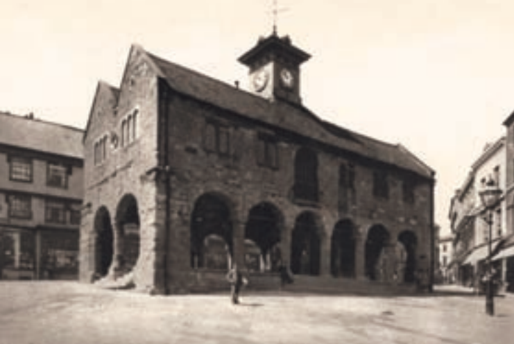
▲ Market Hall in 18th century, Ross on Wye