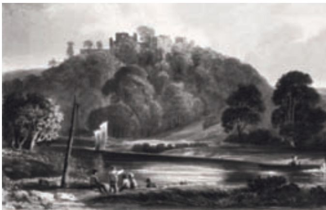
► Goodrich Castle

Goodrich still boasts one of the most complete sets of medieval domestic buildings surviving in any English castle. During the Civil War, Goodrich was held successively by both sides, The famous 'Roaring Meg', the only surviving Civil War mortar, has returned to the castle after 350 years. Now owned by English Heritage the castle is open daily to visitors.