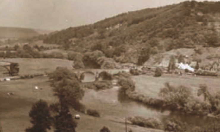
▲ Kerne Bridge from Coppett Hill