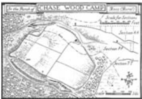
▲ Early Map of Chase Hill fort

Go left on the road, and pass by Mill House on the left and the farm on the right. Cross the road at the corner. Go through a gap by a barred gate (buildings are on the right). Keep ahead through three more barred gates on a permissive path that rises away from the farm. Continue through a pasture to a fourth gate leading into Chase Wood. The path rises, steeply in places, to a junction of tracks. The final challenging climb on the walk leads through Chase Wood up to Chase Hill Iron Age hillfort. Keep ahead and you will soon see the Iron Age rampart on the left.