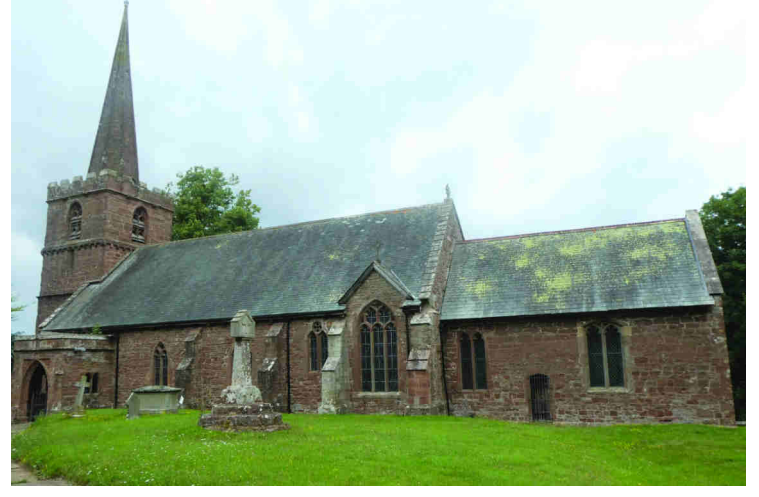
wooden stile and turn left on the road and walk 650m back the starting point at the church.

8. Go along the footpath for 200 m and then go left through a kissing gate into a field. Go straight up the field towards the prominent house and then go right through a (bypassed) kissing gate to another kissing gate in the corner and onto the road at Ruxton Farm. Go left on the road for 60 m and then turn right next to the white cottage, opposite the finger post. Go through the double wooden field gates and straight on to the far side of the field. Go over a wooden stile and cross the farm track in the field and continue ahead again. Leave the field at the