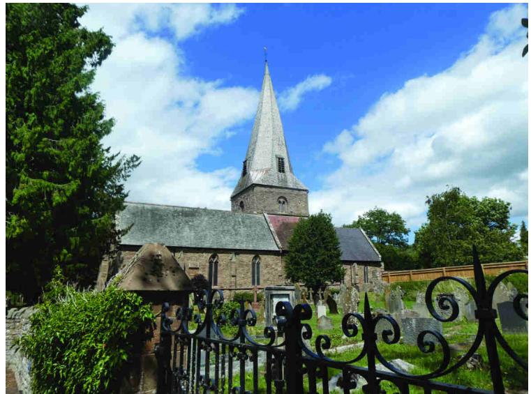
St Mary's Church, Fownhope

The Norman tower dates from the early half of the 12 th century. The fascinating broach spire is clad with shingled oak and is noticeably twisted due to the uneven heating of the sun over the years. On the roadside outside the church are the stocks, together with a whipping post, which makes them unique within the county.