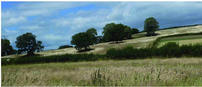
View from Mancell's Ferry

9. Leaving the riverbank go right in the field slightly uphill and follow the right-hand edge of the field. Leave the field through two steel walker's gates high up in the hedge. Continue ahead and after about 25 m cross a track and go slightly uphill and then follow the hedgerow on your right again. At the end of the field go up to the right, through a steel field gate, or over the dilapidated stile if you can. Go up the field following the right hand hedgerow until you come to a marker post by the hedgerow indicating turn left. Walk across the field up to the old barn. Pass to the left side of the barn and go ahead to pass through a steel field gate under an oak tree. Go through a series of two field gates with stiles into a field. Go half right across the field and leave through a wooden kissing gate in the hedgerow. Go diagonally across the next field with the Fownhope church spire appearing in front of you. Continue down the field to cross a stile in the bottom corner next to a field gate. Walk along the left side of the field, through a steel kissing gate and turn right on the road to return to the recreation ground at Fownhope.