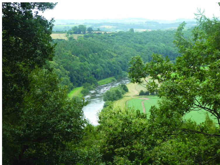
River Wye from Viewpoint

8. On reaching the road you go right, but firstly it is worth going 30 m to your left to the viewpoint overlooking the River Wye with an interesting timber carving and guide map. Go back up to the top of the hill to continue the walk, staying on the tree-lined road downhill for 600 m. At the bottom of the hill cut back to the left at a finger post going down a track. After 30 m, fork right onto a path at the marker post and go steeply downhill into the trees to suddenly find yourself on the banks of the beautiful River Wye. Turn right over the stile into a field. Follow the riverbank 1.2 km (0.75 ml) going over a steel bridge, a wooden stile and through two field gates to reach the pretty cottage at Mancell's Ferry. Use the two stiles to pass through the garden. Please do not linger in this private garden.