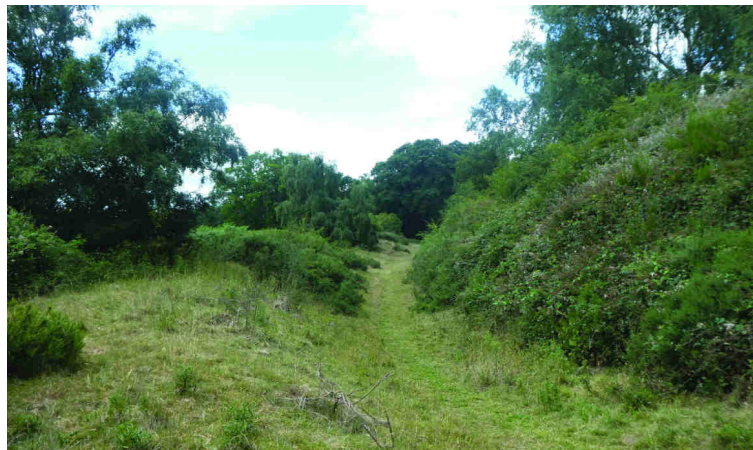
Capler Camp Ramparts

7. After the steps, keep right and then go ahead with the old barn immediately on your left. Go right and continue with the steep sided ramparts to your right and the second lower ramparts on your left. Fabulous views to the left including Mayhill and Chase Hill just behind Ross on Wye. As you continue through the ramparts you can diverge slightly up the bank to the right to view the huge open space at the centre of the camp. Continue on the path through the ramparts. Go through a wooden gate onto a downhill track in the woods. Leave the track and go half left down into the woods at the rather poor finger post, leaving the camp behind you. Reach a track and go left and then meet another track where you go straight ahead down the hill to a road.