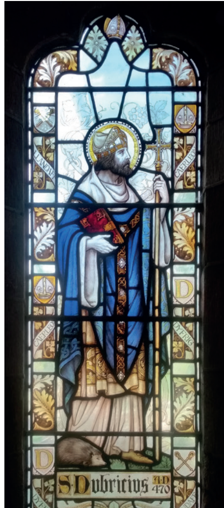
St Dyfrig is remembered in this stained glass window at Hentland Church (13). Can you spot the hedgehog, which was the symbol of anicent Eryng (Archenfield)?

Three churches in the Wye Valley are dedicated to Dyfrig - Hentland, Ballingham, and Whitchurch.