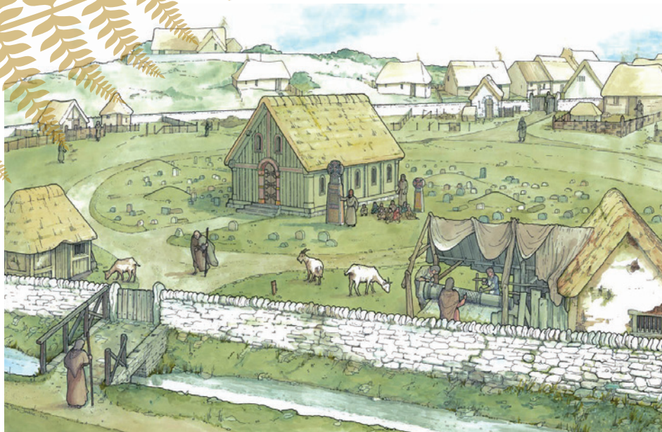
Reconstruction of an early Celtic Church, based on St Illtud's Church Llantwit Major. This church was established by St Illtud, said to have been a student of St Dyfrig at Hentland Church.