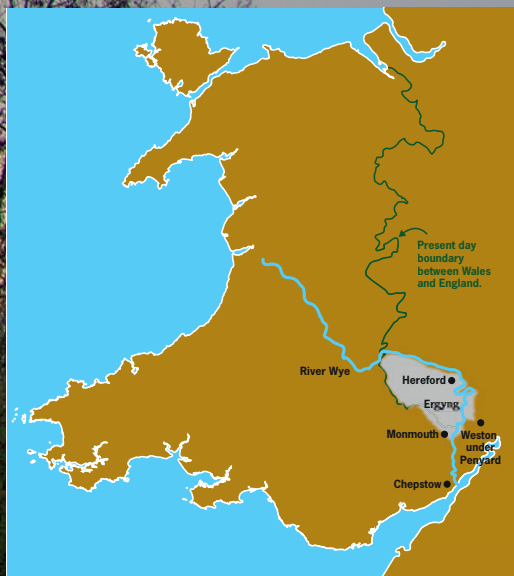
Map showing location of the early Welsh Kingdom of Ergyng.

Ergyng's capital was possibly at Ariconium (today's Weston under Penyard). Ergyng included parts of the Forest of Dean at some points in history.