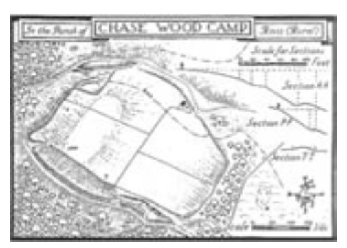
▲ Early Map of Chase Hill fort

Go left on the road, and pass by Mill House on the left and the farm on the right. Cross the road at the corner. Go through a gap by a barred gate (buildings are on the right). Keep ahead through three more barred gates on a permissive path that rises away from the farm. Continue through a pasture to a fourth gate leading into Chase Wood. The path rises, steeply in places. to a junction of tracks. The final challenging climb on the walk leads through Chase Wood up to Chase Hill Iron Age hillfort. Keep ahead and you will soon see the Iron Age rampart on the left.