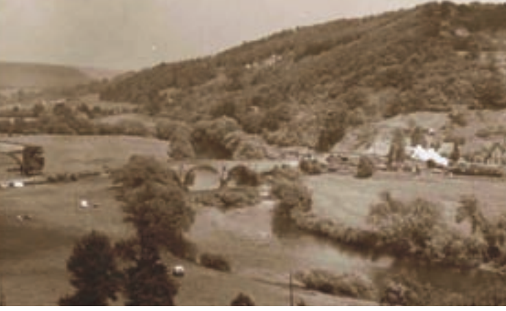
▲ Kerne Bridge from Coppett Hill