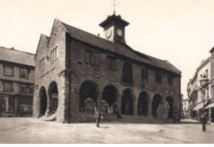
▲ Market Hall in 18th century, Ross on Wye